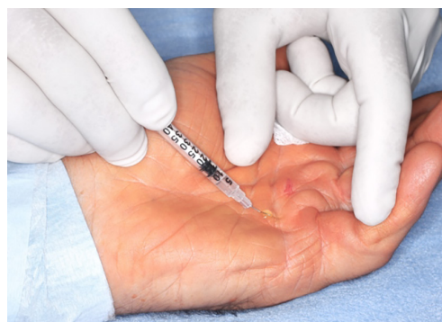
Figure 3. Injection of Clostridium histolyticum collagenase into the fibrotic ligament, end of the intervention