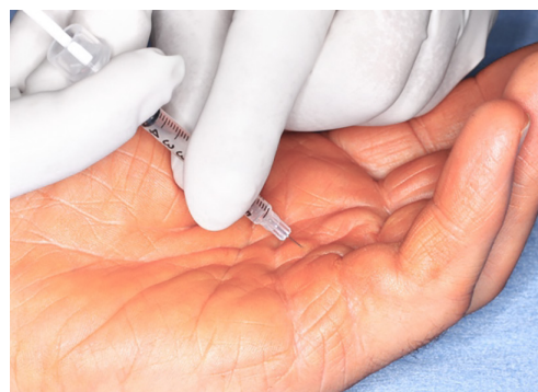
Figure 2. Injection of Clostridium histolyticum collagenase into the fibrotic ligament, a continuation of intervention