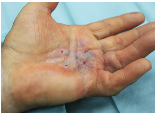
Figure 5. Palm surface of the hand after treatment of Dupuytren's contracture of the index, middle, ring fingers and little finger with collagenase of Clostridium histolyticum

In 11 (73.3%) patients of the main group, the first and only injection of Clostridium histolyticum collagenase demonstrated its effectiveness, which allowed to break the fibrous cord and achieve freedom of movement in the affected finger or several fingers. However, for 4 (26.7%) patients, the initial application of Clostridium histolyticum collagenase was ineffective and did not allow for the complete release of one or more fingers. All patients who failed the first treatment attempt were offered a second intervention at intervals of at least 4 weeks, to which all patients agreed.