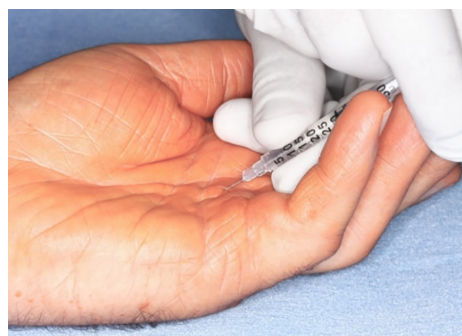
Figure 1. Injection of Clostridium histolyticum collagenase into the fibrotic ligament, the beginning of the intervention

The technique of injecting Clostridium histolyticum collagenase into the affected tendon cord includes three stages and is shown in detail in Figures 1-3. The doctor performing the intervention makes only one puncture of the skin and then directs the drug in different directions, changing the angle of the needle.